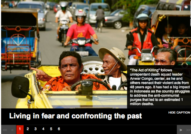
"The Act of Killing" follows unrepentant death squad leader Anwar Congo, center, as he and others reenact their violent acts from 48 years ago. It has had a big impact in Indonesia as the country struggles to address the anti-communist purges that led to an estimated 1 million deaths.

By Dean Irvine, CNN September 30, 2013 -- Updated 0817 GMT (1617 HKT)